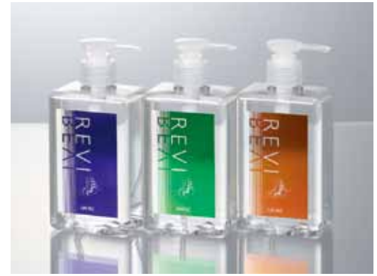
▲ Front View ▼ Side View